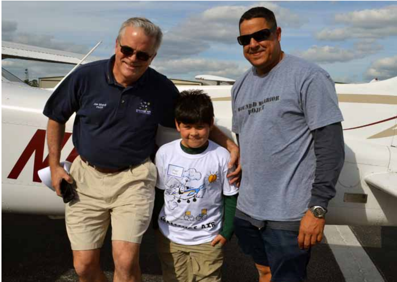
Challenge Air for Kids and Friends