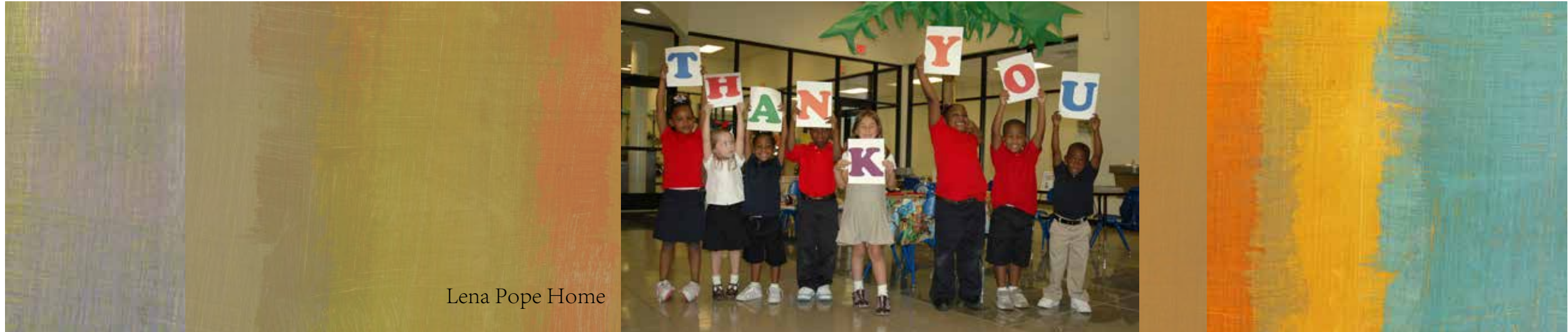
Lena Pope Home