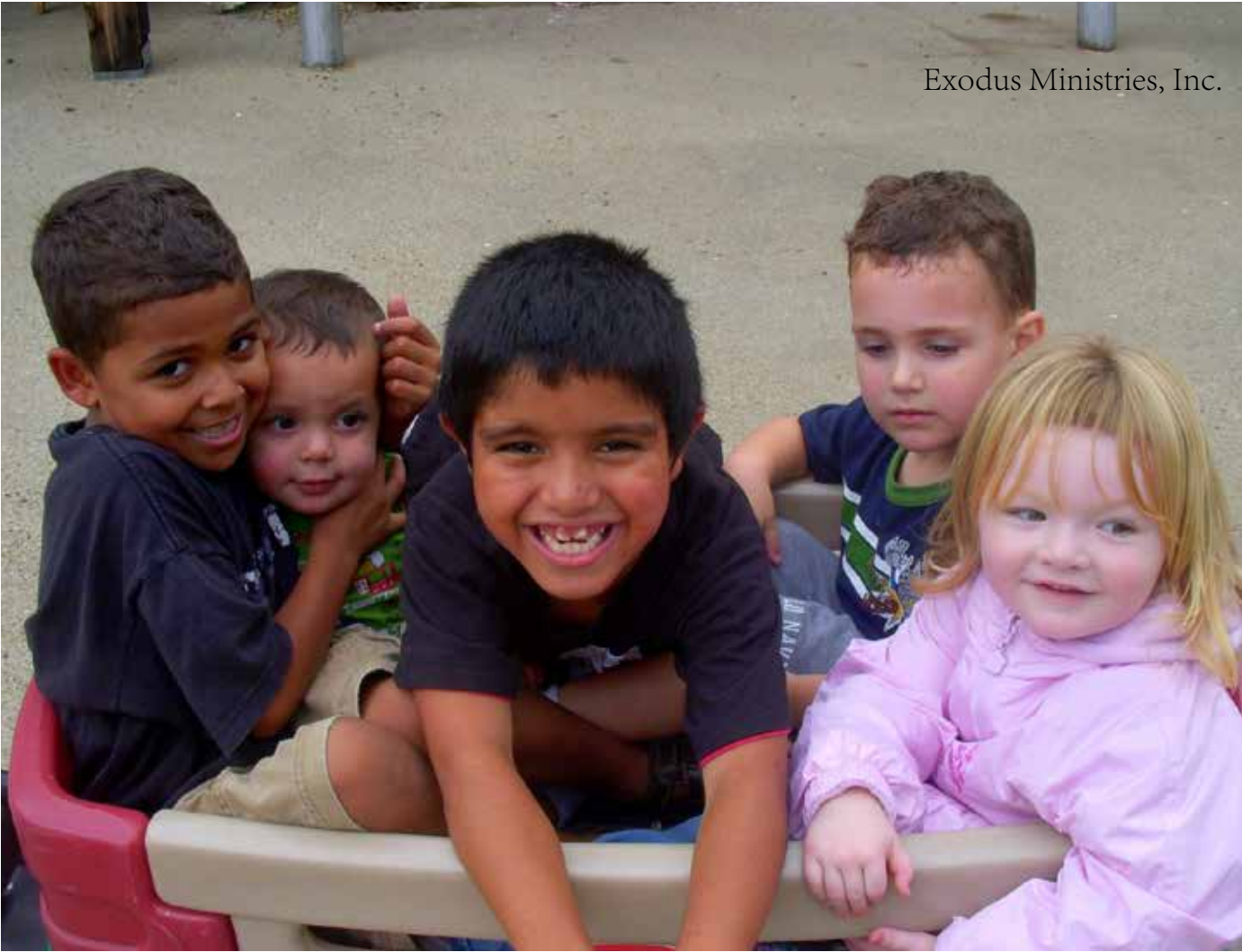
Exodus Ministries, Inc.

Family Place, The $25,000 Dallas, TX Funding for the Safe Campus Child Development Center which provides therapeutic child care for children of domestic abuse victims.